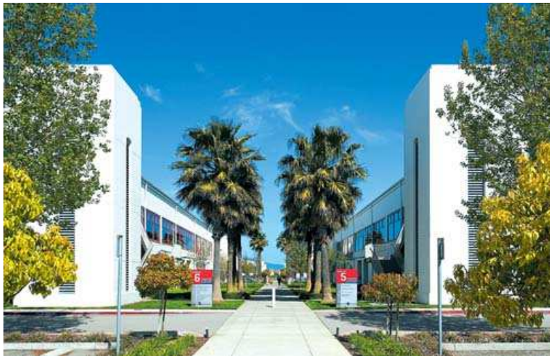
Buildings 5 and 6 in the Hamilton Landing business complex

Recent projects credited to the Novato group include the 2K series of sports games as well as adventure games BioShock 2 and The Bureau: XCom Declassified , which was released earlier this year.